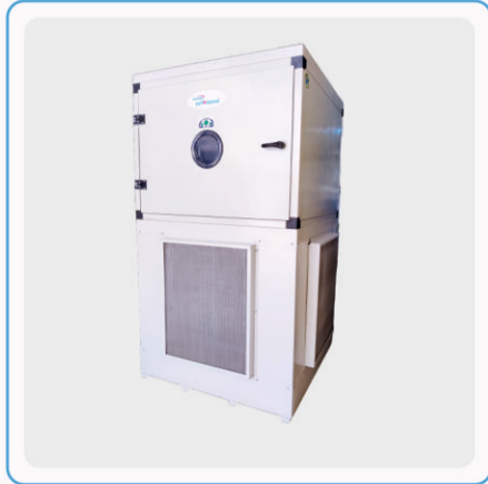
EC PLUG AWU-10000