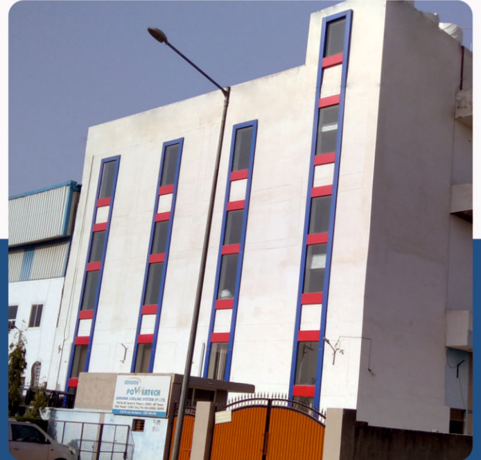
MANUFACTURING PLANT BAWAL (HARYANA)