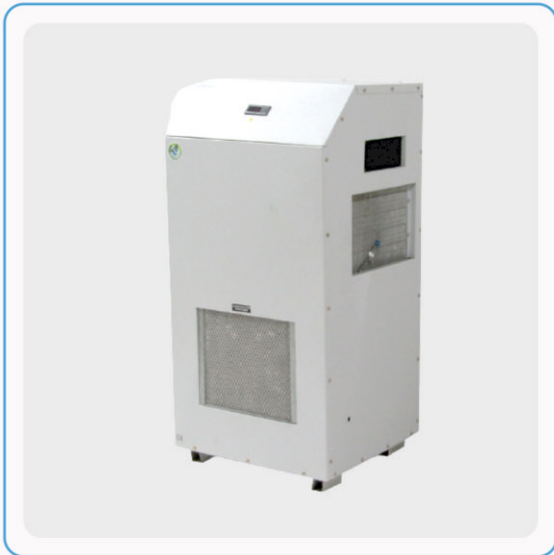
STAND ALONE UNIT