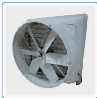
EXHAUST FAN (PP)