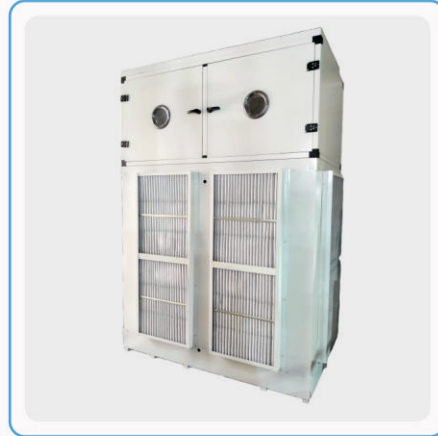
EC PLUG AWU-20000