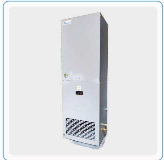
WATER COOLED UNIT