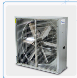
EXHAUST FAN (SS)