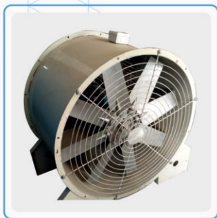
AXIAL FLOW FAN