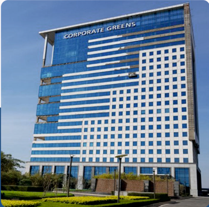
CORPORATE OFFICE DLF CORPORATE GREEN (GURGAON)